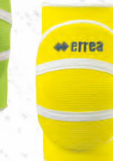
0331 yellow fluo