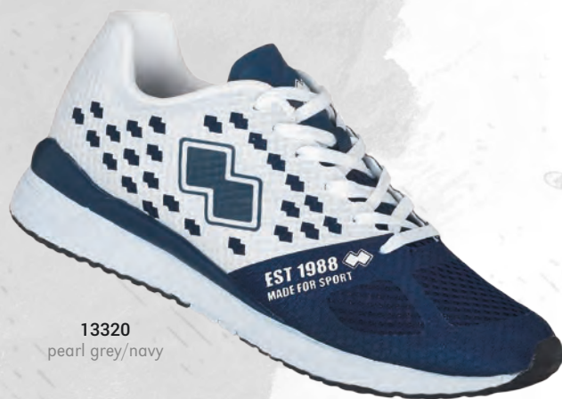
13320 pearl grey/navy