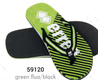
59120 green fluo/black