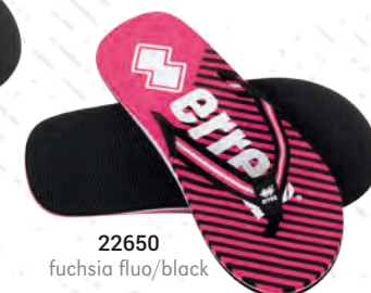
22650 fuchsia fluo/black