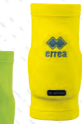
0331 yellow fluo