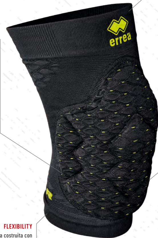
07720 black/yellow fluo

Sur la face avant de la genouillère, dans la zone rembourrée, on utilise de la fibre de CORDURA® afin de garantir une meilleure résistance à l'abrasion. Ce fil spécial est destiné avant tout aux sports de haute montagne.