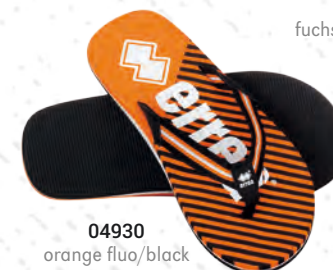
04930 orange fluo/black